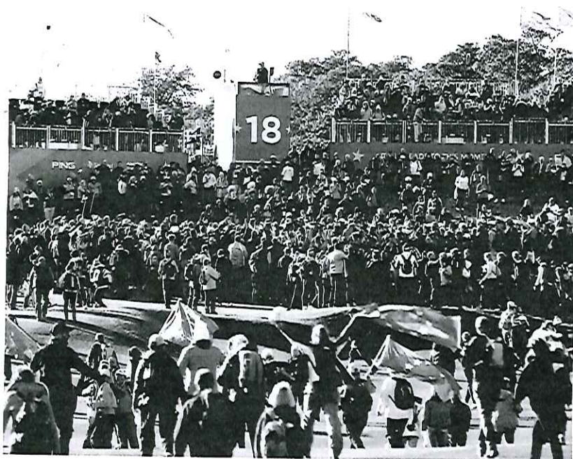
The Gleneagles crowd was treated to a wonderful spectacle

I have to say, in my opinion Sky Sports Golf is doing a good job at covering these events, while at the same time understanding the free-to-view argument. However, once again slow play came along (although the weather didn't help) and we witnessed some excruciating waits before a stroke was taken.